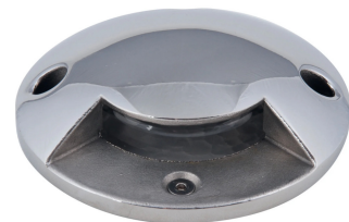
C1 - COVER FLOORING INOX 10 - MONO-EMISSION