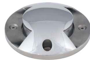
C2 - COVER FLOORING INOX 10 - BI-EMISSION