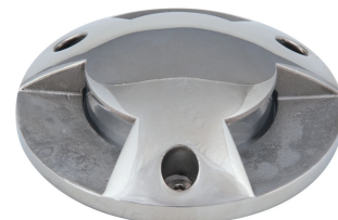
C3 - COVER FLOORING INOX 10 - TRIPLE-EMISSION